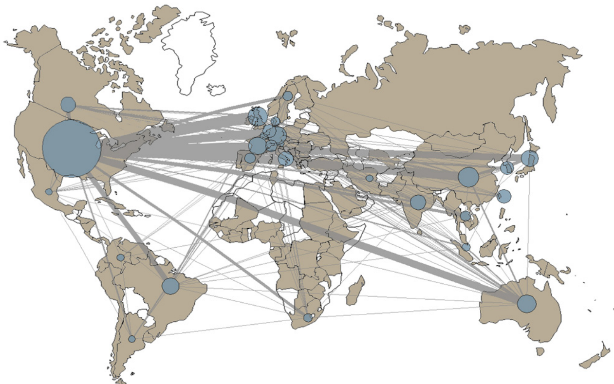
Figure 2: Global distribution and patterns of collaborations of publications on vaccine development.